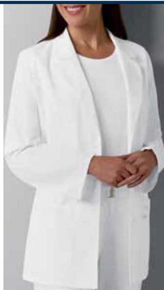
1481 - EMBROIDERED LAB COAT XS-2XL • White (WHTS) Brushed Cotton/Poly Poplin A curved notch lapel lab coat features tone on tone leaf embroidery on the right front collar and on top of two patch pockets. Princess seaming and an adjustable back ties for a slimming, professional look. Center back length 29".