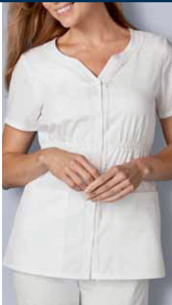
2733 - BUTTON FRONT V-NECK TOP XS-3XL • White (WHFT) 100% Cotton French Twill French twill novelty v-neck, with delicate lace edged button front placket, empire waist with all-around elastic, two front patch pockets, and side vents. Center back length 27".