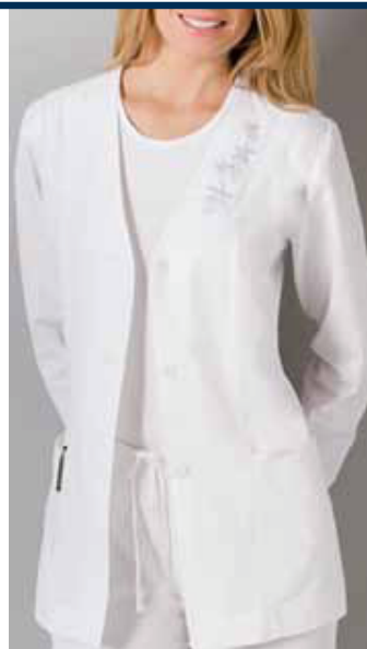
1403 - EMBROIDERED CARDIGAN LAB COAT XS-3XL • White (WHTS) Brushed Cotton/Poly Poplin A shaped v-neck cardigan lab coat features pretty floral embroidery on the neckline edge. Additional details include front and back princess seaming, front patch pockets, and center back smocked elastic with side button waist tabs for flattering fit. Center back length 29".