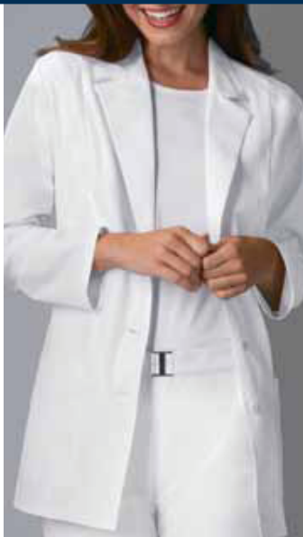
2321 - NOTCHED LAPEL LAB COAT XS-2XL • White (WHTD) Cotton/Poly Poplin Notched lapel lab coat has front and back princess seams. Two front faux flap pockets with pin tucks and a center back belt. Center back length 30".