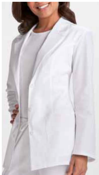
2371 - EMBROIDERED LAB COAT XS-3XL • White (WHTS) Brushed Cotton/Poly Poplin A long sleeve, three button, notched lapel lab coat features beautiful vintage style embroidery on the front patch pockets. Front princess seaming, a back belt and back princess seaming complete the picture. Center back length 29".