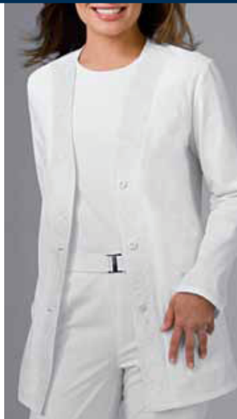
2332 - V-NECK CARDIGAN XS-3XL • White (WHTS) Brushed Cotton/Poly Poplin A shaped v-neck cardigan has feminine lace running down the front neckline and on the back belt. Princess seaming at back, side vents and two front patch pockets. Center back length 29½".