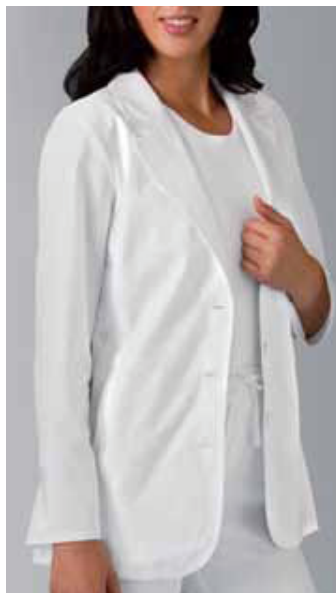
2362 - EMBROIDERED LAB COAT XS-2XL • White (WHTD) Cotton/Poly Poplin Allover floral embroidery enhances the front of this princess seamed lab coat. Two roomy inseam pockets, back princess seams and a back belt complete this style. Center back length 29".