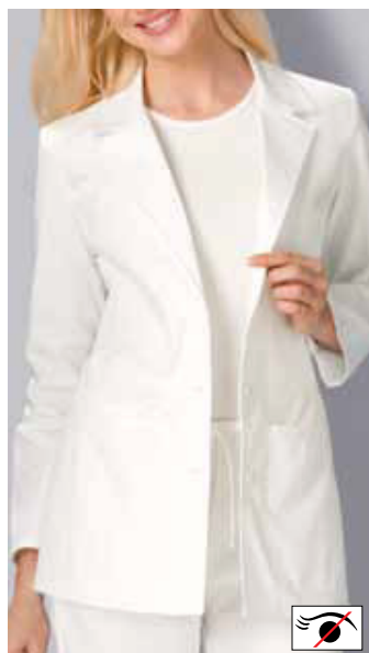
2317 - BLAZER STYLE LAB COAT XS-3XL • White (WHTC) Poly/Cotton Twill with soil release A fitted blazer-style lab coat features two front patch pockets with additional side entry pockets, a three button front, slimming front and back princess seams and a sewn in back belt with four release pleats for ease of movement. Center back length 28".