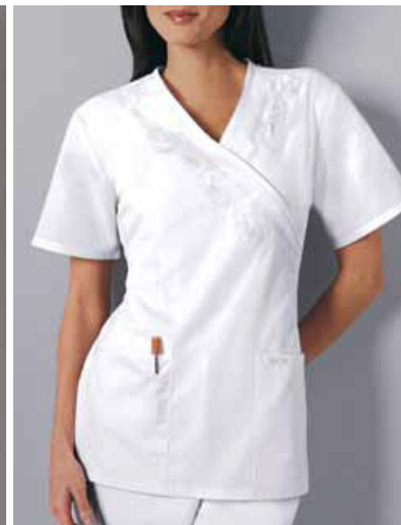
2900 - EMBROIDERED MOCK WRAP TUNIC XS-3XL • White (WHTC) Poly/Cotton Poplin with soil release White on white embroidery adorns the neckline. Two patch pockets, side vents and adjustable back tie. Center back length 27½".