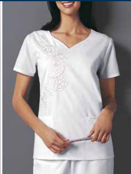
2942 - EMBROIDERED SLIM FIT TOP XS-3XL • White (WHTS) Brushed Cotton/Poly Poplin A slim fit, shaped top sports puff floral embroidery, sweetheart neckline, short sleeves and two patch pockets. Center back length 25”.