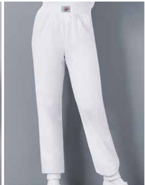
160 - RIB KNIT CUFF PANT XS-5XL • White (WHT) Cotton/Poly Poplin Elastic waist pant with matching rib knit cuffs, fancy waist label and two side pockets. Inseam 28½”.