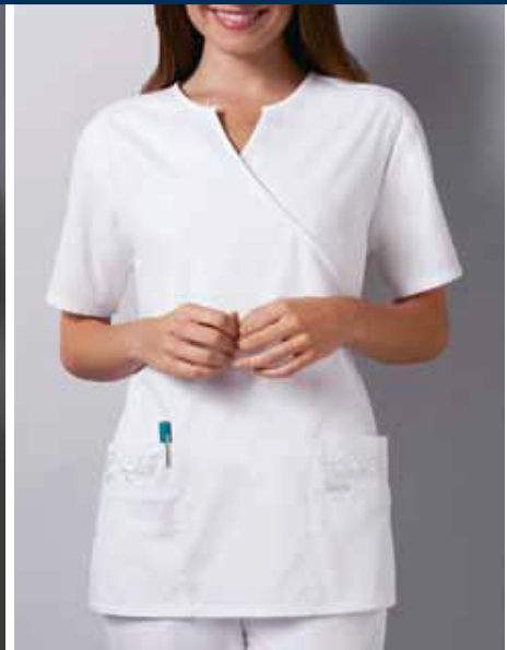
2951 - EMBROIDERED MOCK WRAP TUNIC XS-2XL • White (WHTS) Brushed Cotton/Poly Poplin Mock wrap tunic features embroidery on the bands of the two patch pockets. Side vents and adjustable back tie. Center back length 27”.