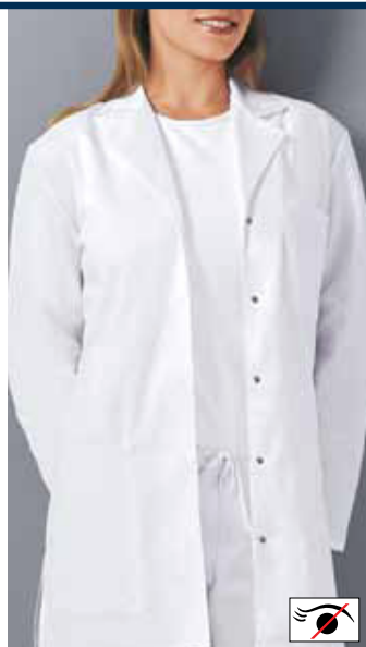
1369 - 32" SNAP FRONT LAB COAT XS-3XL • White (WHT) Poly/Cotton Twill with soil release Two patch pockets, a cell phone pocket, a chest pocket. Snap back belt detail, side vents. Princess seaming, front darts and a back yoke for easy shaping. Center back length 32".

Whether they are required or if you need a garment that just looks professional and goes with everything, we offer a collection of whites that feature “Can’t See Thru Me” Poly/Cotton Twill. So even our most delicate looking designs are durable, easy-care and professional.