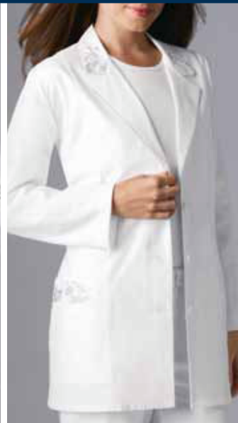
2350 - EMBROIDERED LAB COAT XS-2XL • White (WHTS) Brushed Cotton/Poly Poplin Notched lapel lab coat features embroidery on the collar and two pocket bands. Princess seaming in front and back for added shape and a center back belt. Center back length 30".