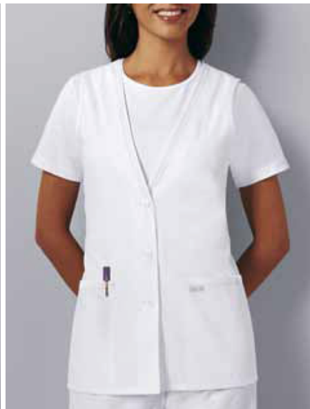
2610 - LACE TRIMMED VEST XS-3XL • White (WHTD) Cotton/Poly Poplin Feminine lace edges the v-neckline, the top edge of the patch pockets and the center back belt of a button front vest. Princess seaming gives soft shaping to the back. Center back length 28”.