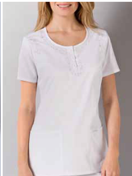
2893 - EMBROIDERED ROUND NECK TOP XS-3XL • White (WHTS) Brushed Cotton/Poly Poplin Round neck top with front button placket, features floral embroidery around neckline, front placket and armholes, patch pockets, side vents and center elastic for figure flattering fit. Center back length 27".