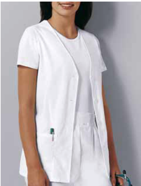
1602 - BUTTON DOWN VEST XS-3XL • White (WHT) Cotton/Poly Poplin A sporty vest with button front styling and two roomy patch pockets. Soft elastic shirring in center back. Center back length 29”.