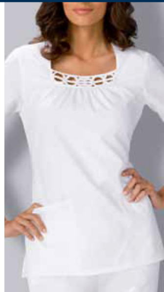
2751 - SQUARE NECK TOP XS-3XL • White (WHTS) Brushed Cotton/Poly Poplin A square neck trimmed in soutache gives this top a unique designer touch. Soft front shirring, angled patch pockets, half back elastic and side vents complete this look. Center back length 26½".