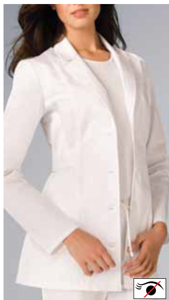
2316 - 30" LAB COAT XS-3XL • White (WHTC) Poly/Cotton Twill with soil release A twill lab coat features a five button front, front princess seams for a flattering fit, front angled pockets, a stylish back belt with buttons detail, back yoke and center back vent. Center back length 30".