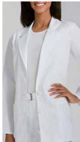
2390 - DAISY EMBROIDERY LAB COAT XS-3XL • White (WHTS) Brushed Cotton/Poly Poplin A notched lapel lab coat features front and back princess seams for flattering fit and front patch pockets. Pretty daisy embroidery on the pocket band and back belt complete this feminine look. Center back length 29½".