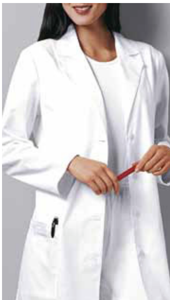
2351 - LADY LUXE LAB COAT XS-2XL • White (WHTD) Cotton/Poly Poplin Lab coat with notched lapel, front and back princess seams. Jacquard ribbon trims the pockets and a center back belt. Center back length 33".