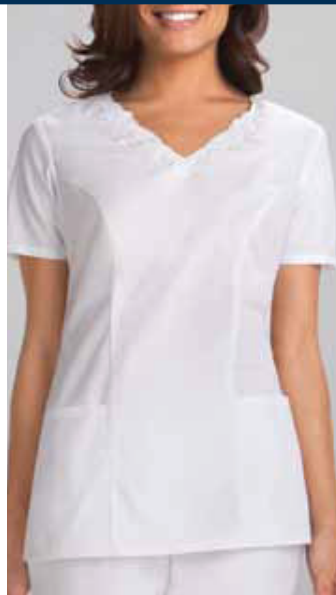
2741 - V-NECK EMBROIDERED TOP XS-3XL • White (WHTS) Brushed Cotton/Poly Poplin A v-neck top features beautiful vintage style cut-out embroidery around front neckline. Also featured are front princess seams, front patch pockets, side vents, and half back elastic for flattering shape. Center back length 26".