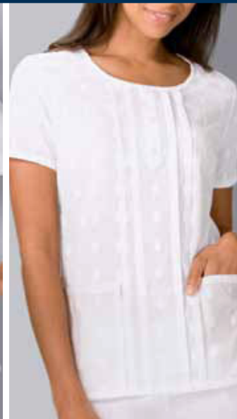
2763 - ROUND NECK TOP XS-3XL • White (WHCG) 100% Cotton Clip Geo A round neck top features a three button faux front placket between four rows of pin tucks, two rows of delicate lace trim at the shoulder, front bust darts for flattering fit, two front patch pockets, half back elastic and side vents. Center back length 26".