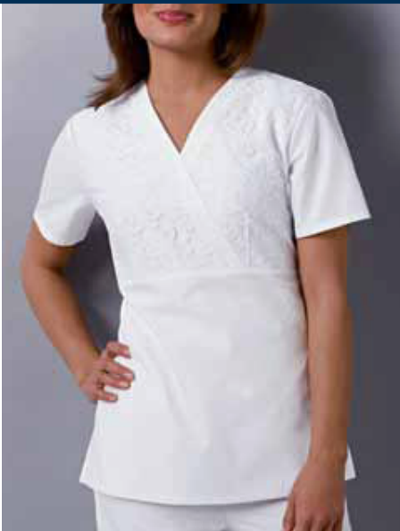
2930 - MOCK CROSS OVER TOP XS-3XL • White (WHTS) Brushed Cotton/Poly Poplin Feminine lace is placed all over the front bodice of an empire waist top. Rounded inseam pockets, side vents and adjustable back ties complete the picture. Center back length 26½”.