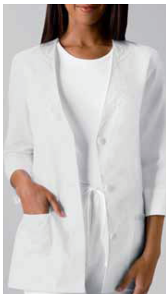
1491 - THREE QUARTER SLEEVE JACKET XS-2XL • White (WHTD) Cotton/Poly Poplin This three quarter sleeve jacket has front and back princess seams with back belt detail. Tonal embroidered flowers, vines and leaves accent the front neckline. Two deep patch pockets finish the picture. Center back length 28½".