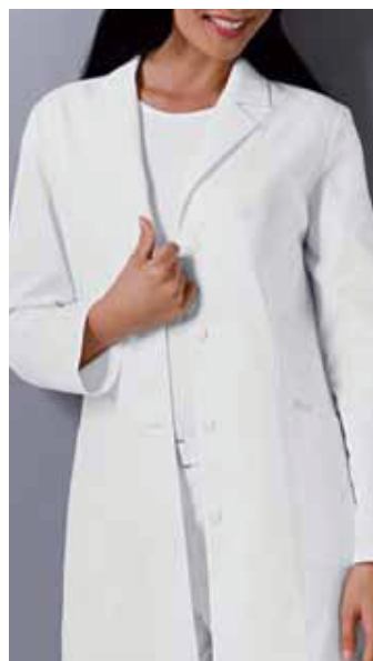
2300 - CLASSIC LAB COAT XS-3XL • White (WHT) Poly/Cotton Poplin with soil release This classic lab coat features a notch lapel and collar, princess seaming, two angled patch pockets, center back belt and side vents. Center back length 32".