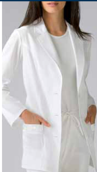
2323 - 30" LAB COAT XS-3XL • White (WHTS) Brushed Cotton/Poly Poplin Blazer style, notched lapel lab coat features beautiful intricate appliqué rondelles lace on front patch pockets, with front and back princess seaming. Center back length 30".