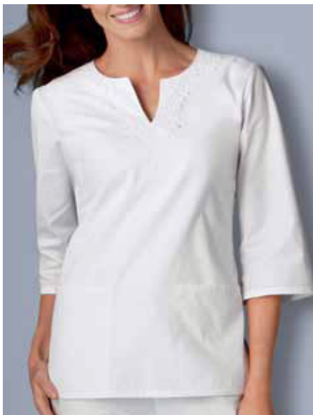
2791 - 3/4 SLEEVE LACE NECK TUNIC XS-3XL • White (WHTS) Brushed Cotton/Poly Poplin Three-quarter sleeve tunic features novelty keyhole neckline embellished by beautiful venice lace applique, front bust darts, front patch pockets, side vents, half back elastic for flattering shape. Center back length 27".